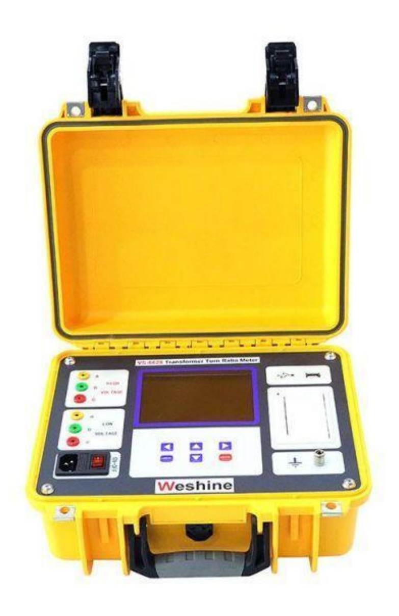
Weshine® Turns Ratio Tester for Turns Ratio Test

The transformation ratio of a transformer is equal to the number of turns of the primary winding divided by the number of turns of the secondary winding. The transformer ratio provides the desired performance of the transformer and the corresponding voltage required by the secondary winding.